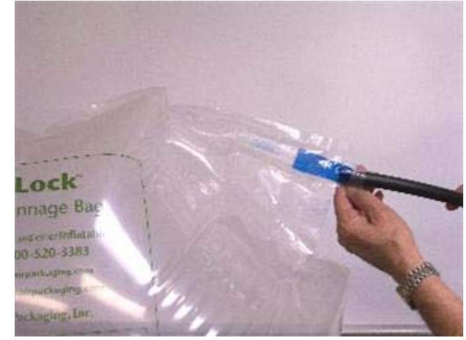
Step 2. Insert deflator tube into blue valve.