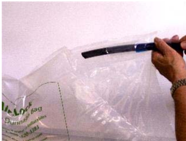
Step 3. While holding valve in left hand, push deflator completely into valve.