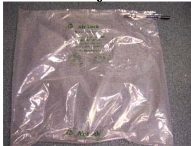
Step 4. Deflated bag is now ready for reuse.