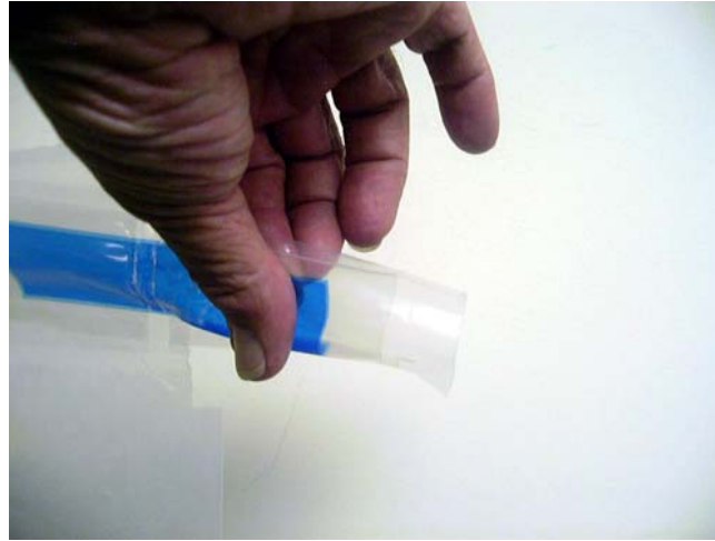
Step 1. Open valve with blue side facing you, by rolling between thumb and index finger.