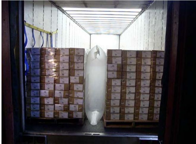
Properly Inflated Bag