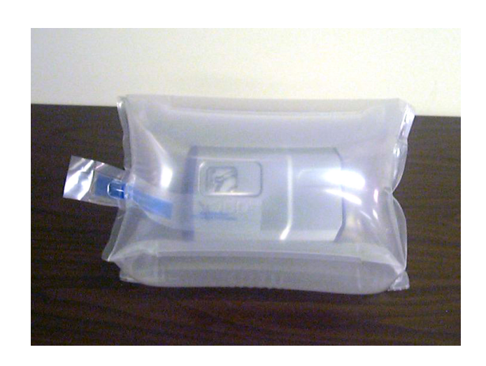
4. When inflation is complete simply remove the inflator. Valve will self seal.