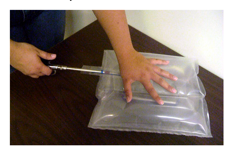
3. Press trigger, allowing air to flow into the sleeve.