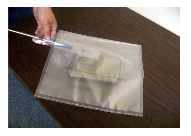
2. Insert inflator into the blue valve.