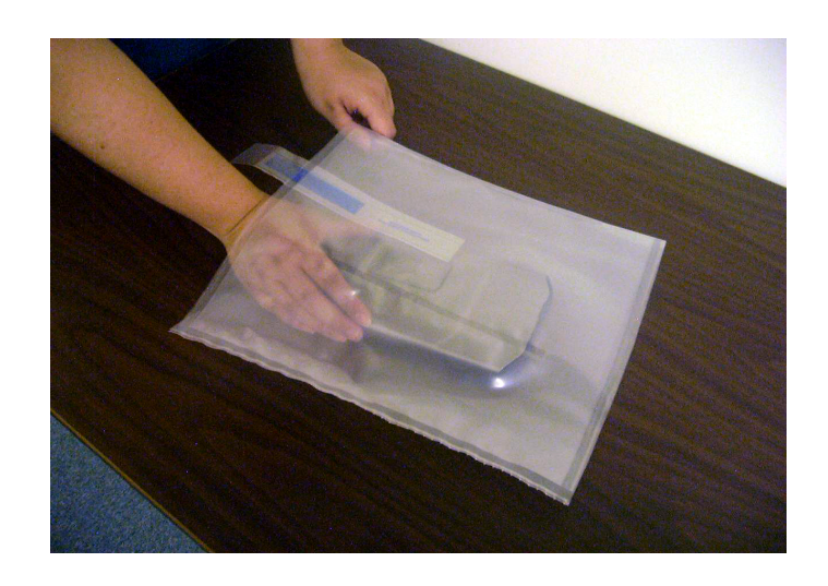
1. Place product centered inside sleeve.