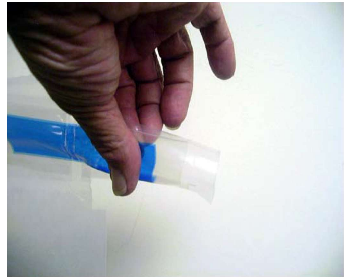
Step 1. Open valve with blue side facing you, by rolling between thumb and index finger.