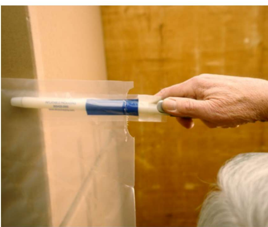
2. Introduzca el inflator en la valvula azul. Pongase el dedo en la valvula para mantenerla bien firme.