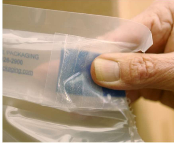
5. Doble la valvula aprentando firmemente con los dedos.