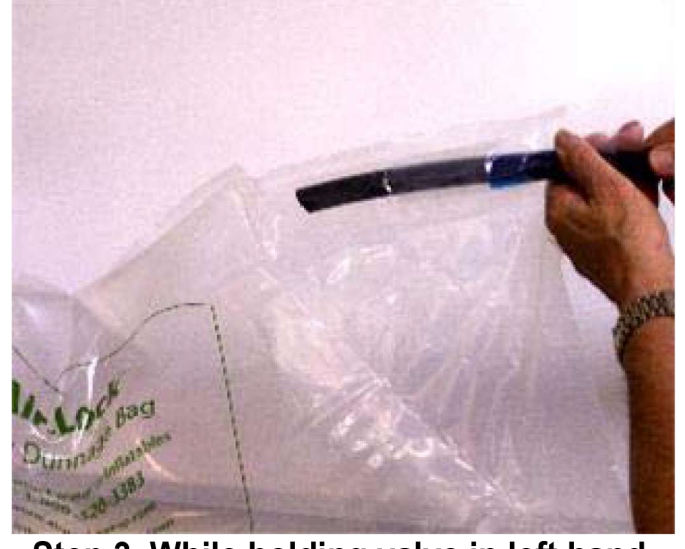
Step 3. While holding valve in left hand, push deflator completely into valve.