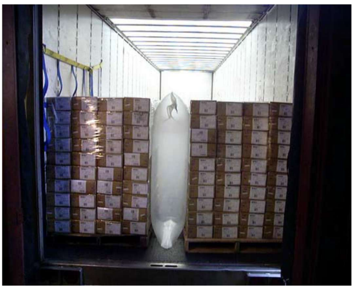
Properly Inflated Bag