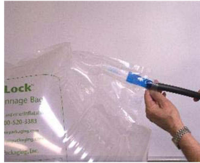
Step 2. Insert deflator tube into blue valve.