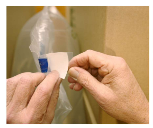
4. Al terminar la inflacion, quite la superficie adhesiva.