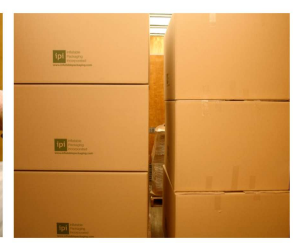
3. Coloque la bolsa entre las paletas. Comience a inflar.