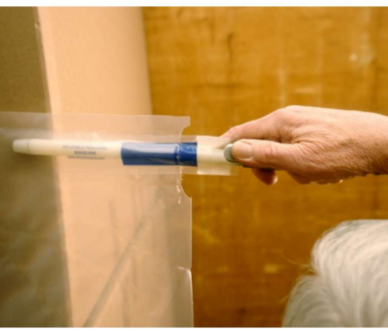
2. Insert inflator into blue valve. Place finger on valve to hold in place.