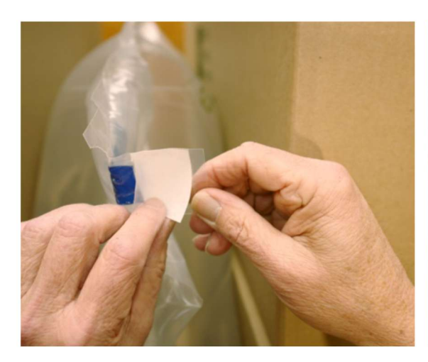
4. After completing inflation, remove peel strip.