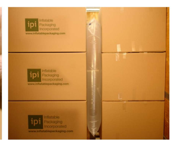
6. La inflacion esta completa y la valvula en este momento esta sellada.