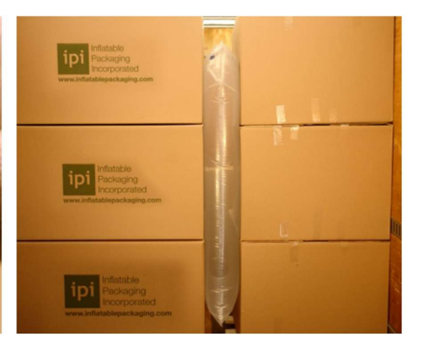
6. Inflation complete. Adhesive valve is now sealed.

INFLATABLE PACKAGING - PO BOX 40 - NEWTOWN, CT 06470 PHONE: 203-426-2900 FAX: 203-426-6976 EMAIL: CONTACT@INFLATABLEPACKAGING.COM