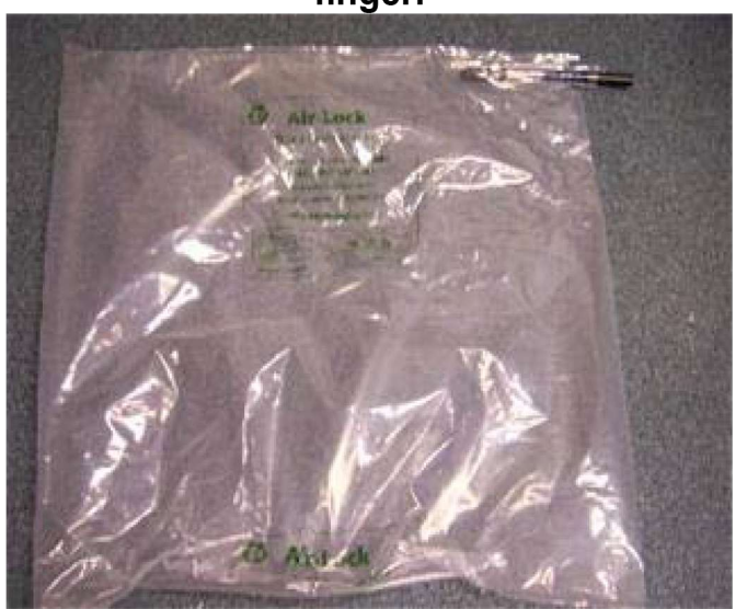
Step 4. Deflated bag is now ready for reuse.