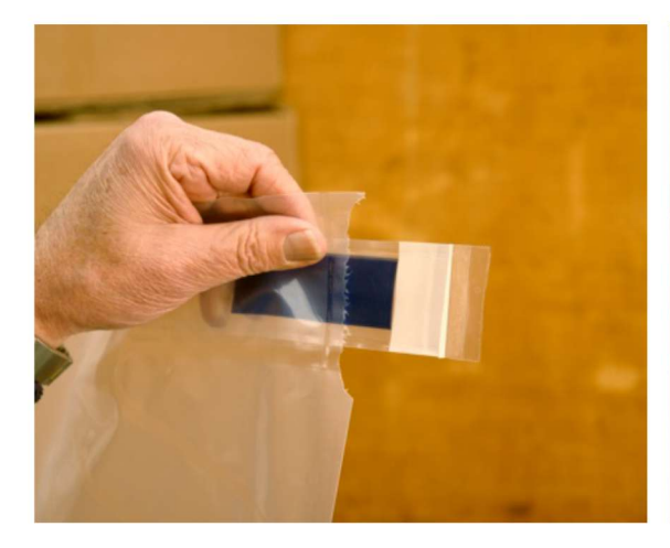
1. Abra la valvula con la superficie adhesiva azul asegurandose que le haga frente y no dorsal.