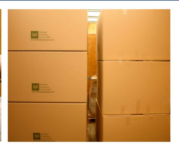
3. Position bag between pallets. Proceed to inflate.